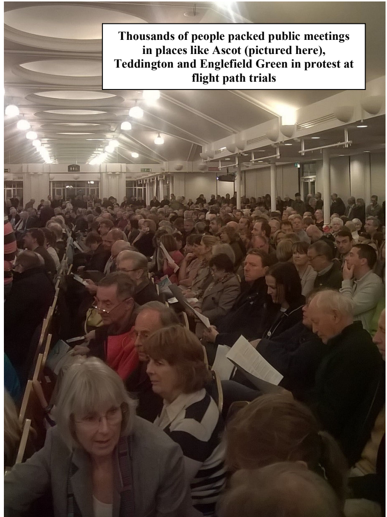
Thousands of people packed public meetings in places like Ascot (pictured here), Teddington and Englefield Green in protest at flight path trials

• Heathrow is to set up a Community Noise Forum to oversee independent research assessing whether the flight paths have returned to normal following the recent trials