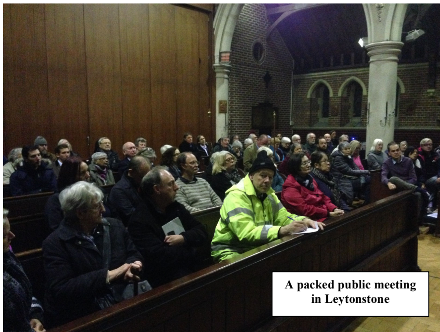
A packed public meeting in Leytonstone

• The CAA (Civil Aviation Authority) oversees the consultation. HACAN East is arguing it was not done correctly. You can add your voice for the consultation to be done afresh by emailing airspace.policy@caa.co.uk . You can read about the campaign on www.hacaneast.org.uk and get updates on the Flight Path Changes facebook or via twitter @PathChanges